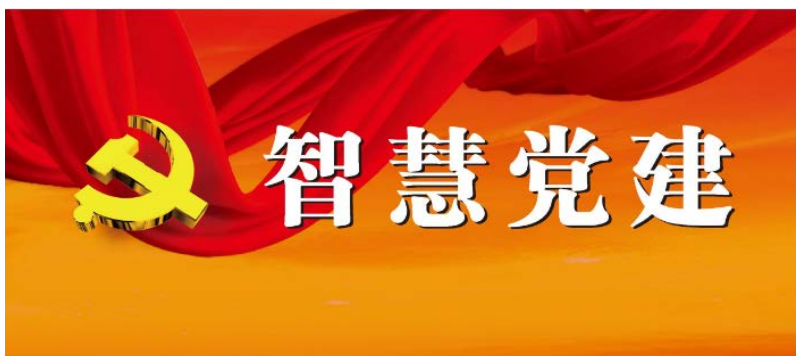
Figure 3 Intelligent party building

With the advent of the "Internet Plus" era, the ideological and political education work and the development of party building work in colleges and universities can also rely on the Internet to fully grasp the study and life habits of contemporary college students, the habits of using new media technology and the way of thinking, and design targeted and interesting online ideological and political courses and party building activities, and actively guide students to actively consolidate their ideological basis and establish firm positions and beliefs. For example, ideological and political teachers can take the important party and state anniversary of our country as the basic guidance, guide the practice of hands-on links, let students personally make micro-lessons or red web pages, so that students can participate in the party building activities, improve their party spirit cultivation. Or build a mobile mutual aid platform, the party's latest ideas and social hot news timely transmission to students, so that students while learning, but also imperceptibly accept the party's education and guidance, so as to become useful to the country and society.