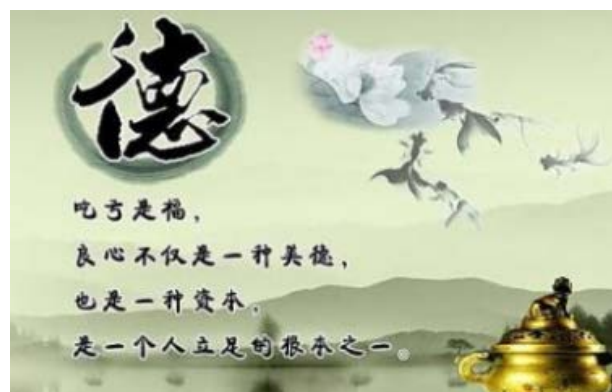
Figure 1 The moral people

At present, some colleges and universities in the process of party building work, its management form is mostly fully assigned to the party branch of the school, this grass-roots management model lack of professional and targeted guidance, such as financial control, personnel management lack of voice and initiative, often in a passive situation. In addition, the boundary between the party and government in some colleges and universities is not clear enough, usually there is the phenomenon of unclear power and responsibility distribution is not concentrated, or everything involved, there is a situation of repeated management; or completely separated, a problem of prevarication. Some of the Party branches are completely out of touch with the school's teaching work, and do not provide an important party spirit for ideological and political education. This disjointed mode of party building has seriously wasted the party resources of colleges and universities, and has an adverse effect on the orderly development of ideological and political work.